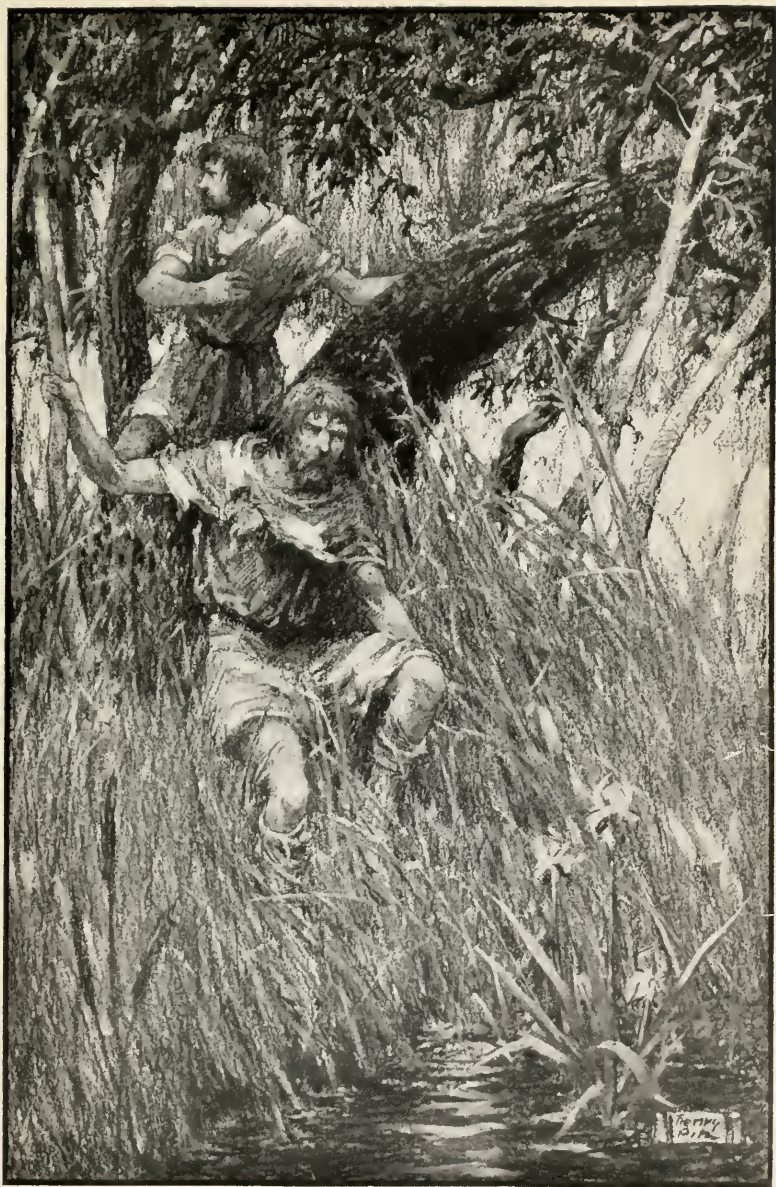
WE STRUCK A STREAM AND DARTED INTO IT